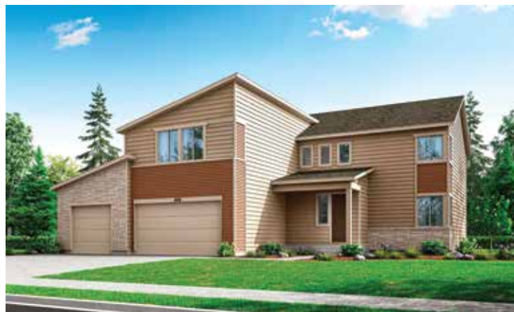
FARMHOUSE W/ RV GARAGE